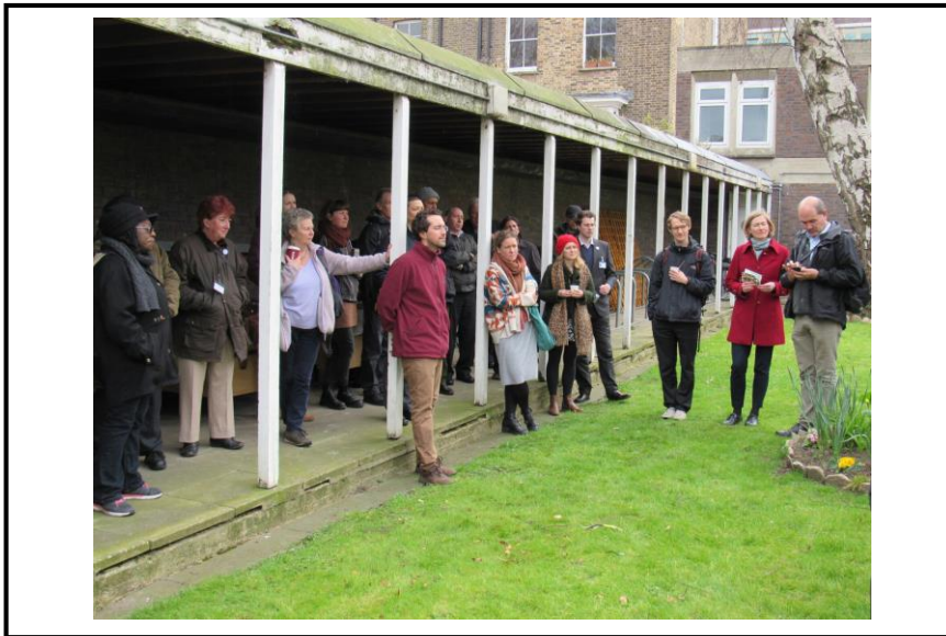
Left: Lambeth GP Food Co-op Members, supporters and guests at the launch of the partnership with Medirest at Kings College Hospital, 24 March 2016

Don't forget to check out our website where you can stay up to date with all the latest news and events from the Lambeth GP Food Cooperative! Just log on to: